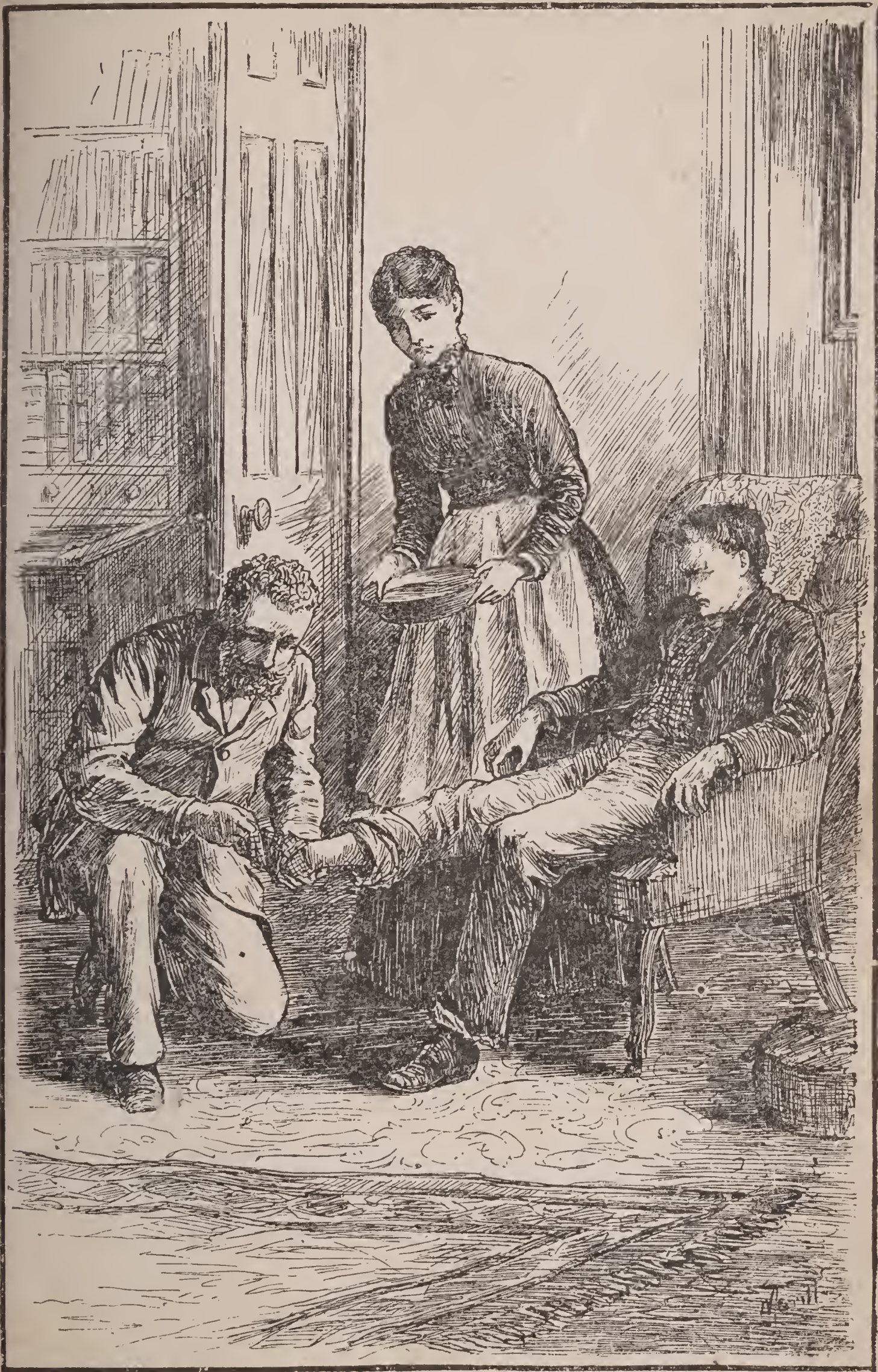
“Mr. Bhaer bathed and bound up the wounded foot, while Mrs. Jo prepared the only empty bed in the house.” — PAGE 162.